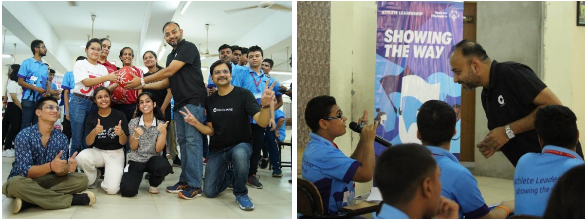
The Macquarie officials at the concluding session of the Athlete leadership Training

The first ever Athlete Leadership Training, supported by Macquarie, held with 15 Athletes and 10-15 Mentors from the Delhi NCR region concluded on 22 June 2024. The Athletes appeared as shining examples of emerging leaders and agents of change. As the leaders dropped their inhibitions to speak, share and support each other, the National Youth leadership Council members brushed their modules, leading sessions and learning through this exercise. The trained Athlete leaders will be absorbed in the NYLC and nearly all will get a chance to enter panel discussions, lead sessions at the online sessions of the training which commenced on 24 July 2024, tapping Athlete potential from nearly 10-12 states of India.