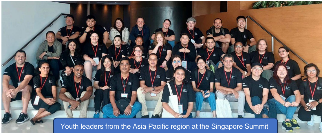
Youth leaders from the Asia Pacific region at the Singapore Summit