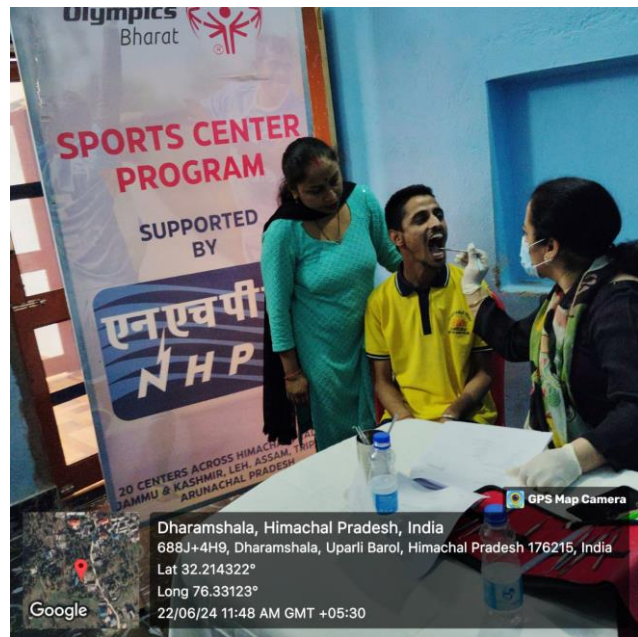
Dental screening in progress in Himachal Pradesh

Kashmir and Ladakh alone conducted screenings of 947 Athletes from the areas which are considered