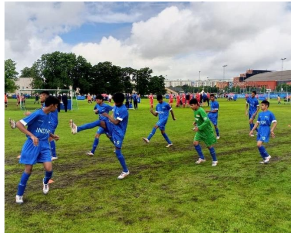
Team India in Sweden