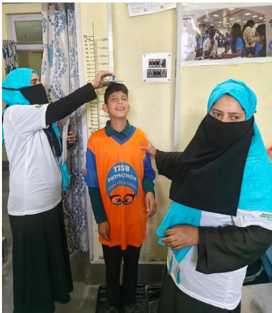
Health screening in progress in Kashmir