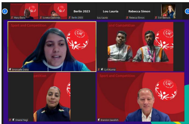
The SOI Global Webinar held on 18 June 2024