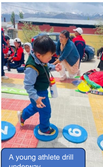
A young athlete drill underway

Kashmir and Ladakh alone conducted screenings of 947 Athletes from the areas which are considered