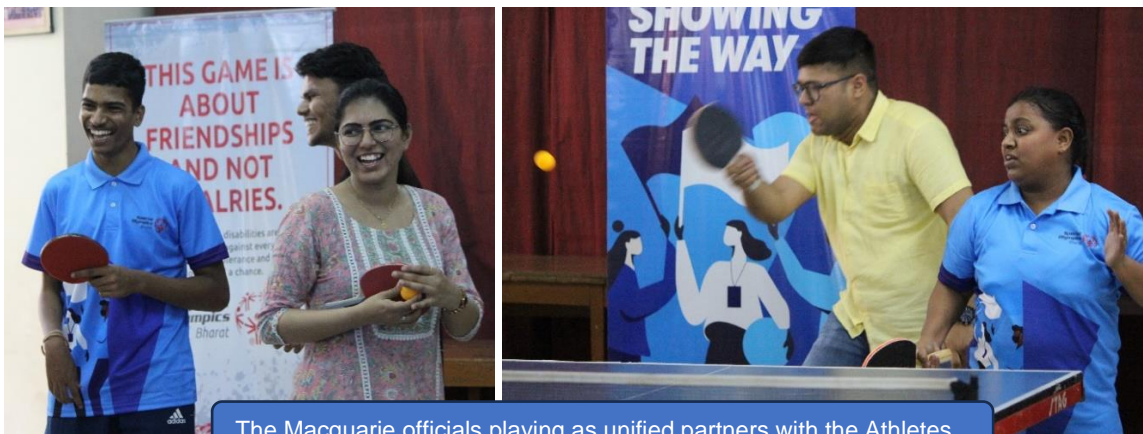
The Macquarie officials playing as unified partners with the Athletes

The preparation now, is of running the online sessions with the aim of exploring talent all over India. The online module has kick-started and the NYLC is furiously putting their minds together to review and smoothen creases, wherever observed.