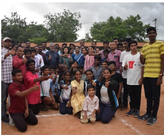
Trainees from SSA at the session