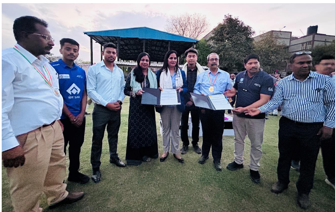
Teams from both organisations at the MoU signing with the IGIPSS

On 28 March 2024, the Directorate of Education inked an agreement with the SO Bharat Delhi Chapter to run ten sports centres in New Delhi committed to offer year-round sports training to approx. 200 Athletes with Intellectual & Developmental disabilities (IDD). The Delhi Govt will pay a remuneration to the Head Coach and Asst Coach (SO Bharat athletes) besides providing sports equipment and T Shirts to the athletes and coaches. To ensure quality training and engagement which will include the Special Olympics additional initiatives (Health, leadership etc), a joint visiting team will be formed, composed of the of the Sports & the inclusive education branch officials and those from SO Bharat.