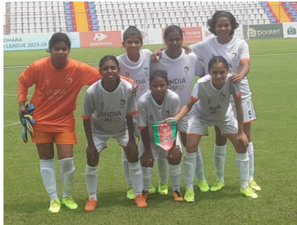
SO Bharat Female team at the football grounds