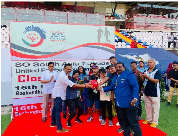
The HOD and Coach of the Indian Team with the officials of SOAP and SO Bangladesh