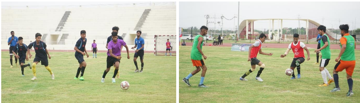
Football league matches taking place in Gwalior

The Championship, marks the very first national level sports event at the facility since its inauguration by the Hon'ble Prime Minister Shri Narendra Modiji, on 2 Oct 2023. The Atal Bihari Training Centre for Disability Sports is a state-of-the-art facility dedicated to training and nurturing athletes with disabilities.