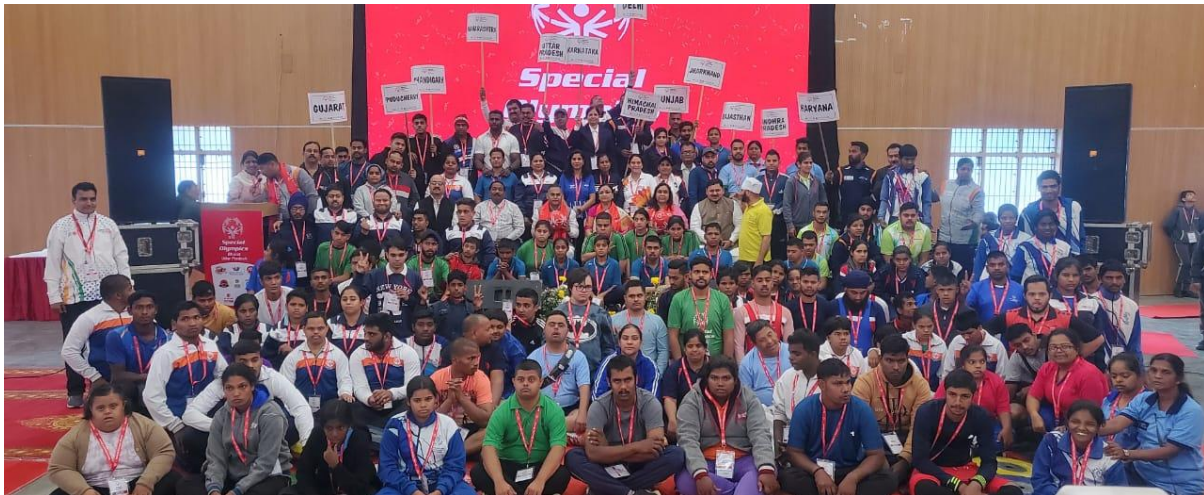
National Championship – Powerlifting , held in CSJM University Kanpur, Uttar Pradesh