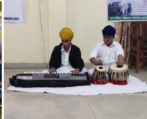
Performance by a sibling pair