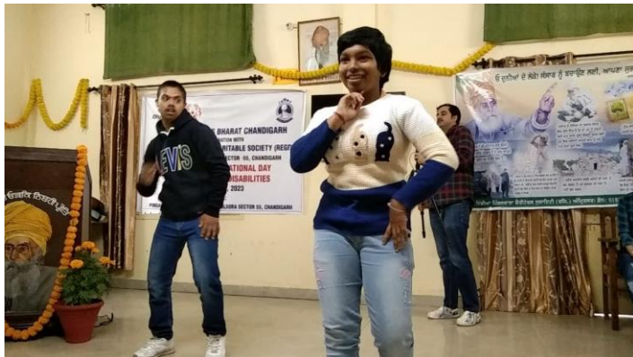
Unified Cultural Performance