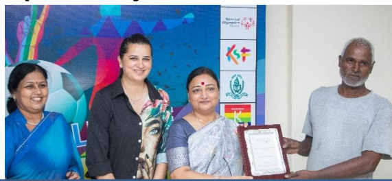
Dr Nadda with Dr Haritma Chopra , Principal Maitreyi College & team