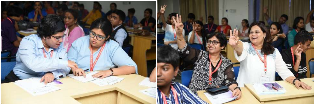
A panel discussion around ' The Change within Me ' included youth leaders with and without ID as panelists and Moderators.